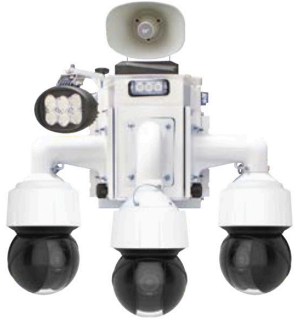
D3 HEAD UNIT